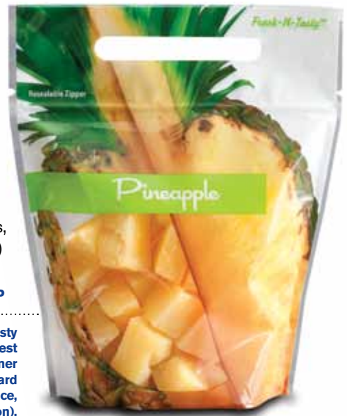
Fresh N Tasty Produce Pouch - Highest Achievement Award Winner (Retail), Gold Award (Packaging Excellence, Technical Innovation).

For more information about the 2012 FPA Flexible Packaging Achievement Awards, contact FPA at (410) 694-0800 or visit www.flexpack.org . FP