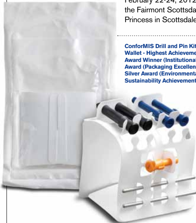
ConforMIS Drill and Pin Kit Wallet - Highest Achievement Award Winner (Institutional), Gold Award (Packaging Excellence), Silver Award (Environmental & Sustainability Achievement)

The competition is open to flexible packaging converters. Additionally, flexible packaging suppliers that have contributed to a package and have received approval from the converter may enter jointly with, or on behalf of, the converter.