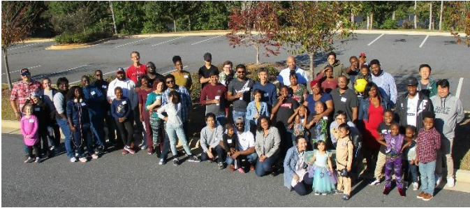
Toppan USA Georgia Plant staff and their families

This movement, stemming from the problem of marine pollution, also brings significant change to barrier film manufacturers. Many major global companies have announced environmental policies, and alliances assembling major suppliers like us have been launched.