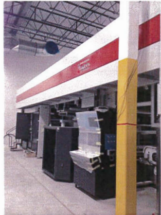
Vonco's new 8 color flexo press