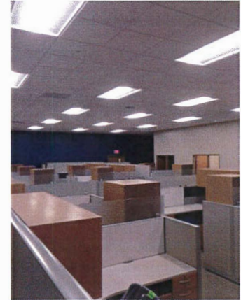
Vonco's new corporate offices

Our commitment remains to minimize any disruption in our ability to produce and service the quality products you expect from Vonco and to keep you updated on when to prepare for updates on your end with our new location. Until then, please continue to use our Lake Villa address and phone numbers you currently are using.