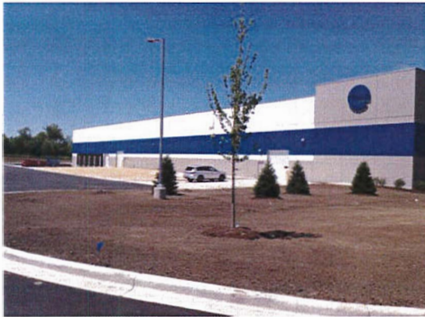
Vonco's Salem Facility

As promised, we are keeping our valued customers informed on our progress and are excited to share a few pictures with you.